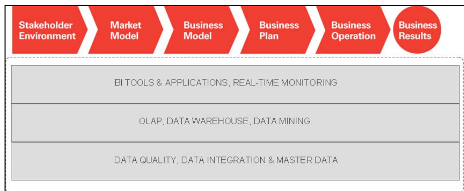
Figure 3. A common EPM foundation underlies the strategy-to-success framework.

Supporting a comprehensive approach to EPM—one that links management processes to operational systems and drives management excellence—requires a strong foundation.